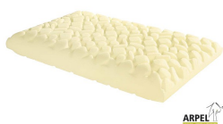
Acquacell Soap pillow